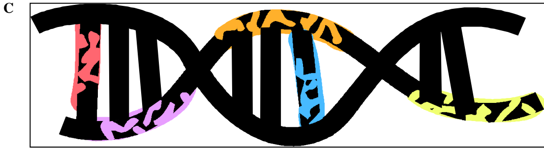
Figure 1 Continued.