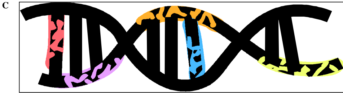
Figure 1 Continued.